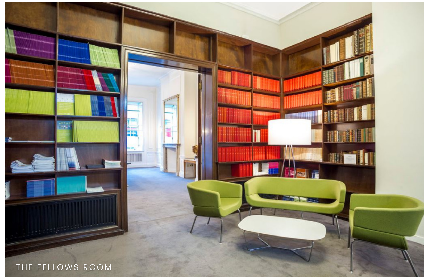
THE FELLOWS ROOM